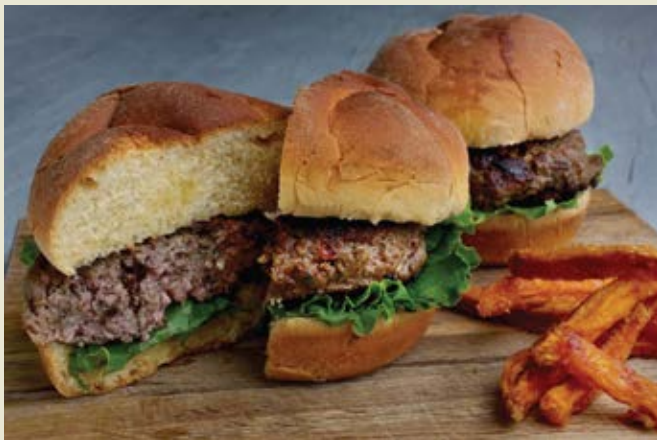
A Mushroom-Blended Graffiti Burger.