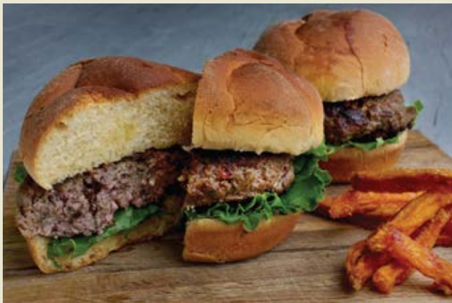
A Mushroom-Blended Graffiti Burger.