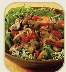
Sautéed Mushroom Salad