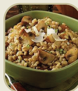
Mushroom Barley Risotto