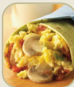
Mushroom and Egg Wrap